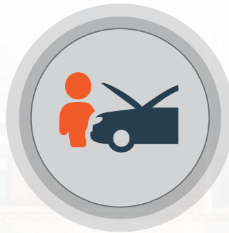
Broken down vehicle