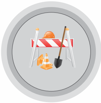
Road Work Zone

Below is a selection of the applications that will be deployed and tested: