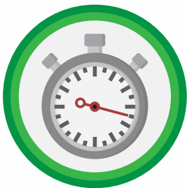
Journey Time Information