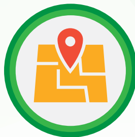
Traveler Info & Navigation