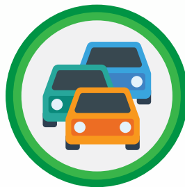
Traffic & Vehicle Counts