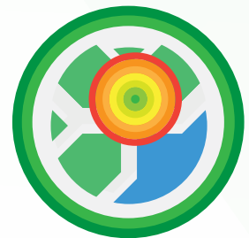
Isodistance & Isochrone