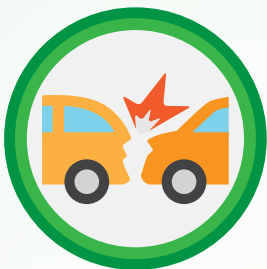
Real-time Incident Detection

QMIC's Traffic platform & Mobility Analytics can be used for many different applications